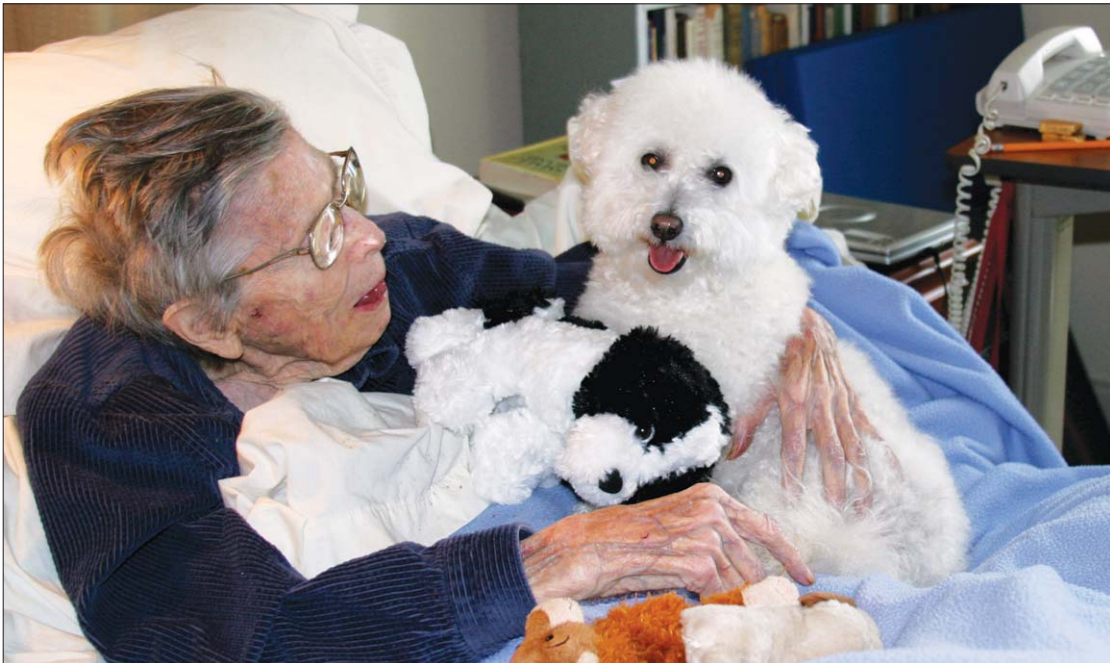
PLAYFUL PUP, "Benji" the Bichon Frise, brings a smile to a senior resident.